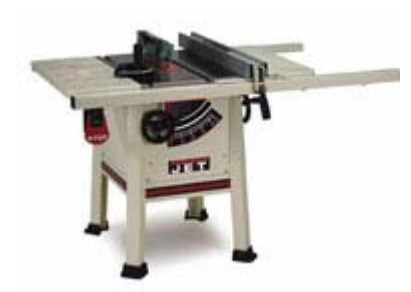
The new JET JPS-10 ProShop saw represents new thinking that makes your shop time more accurate and productive.

This new design also allowed simplifying the assembly process considerably. With the motor installed within the cabinet at the factory, the process of hanging the motor on an external bracket and aligning it with the